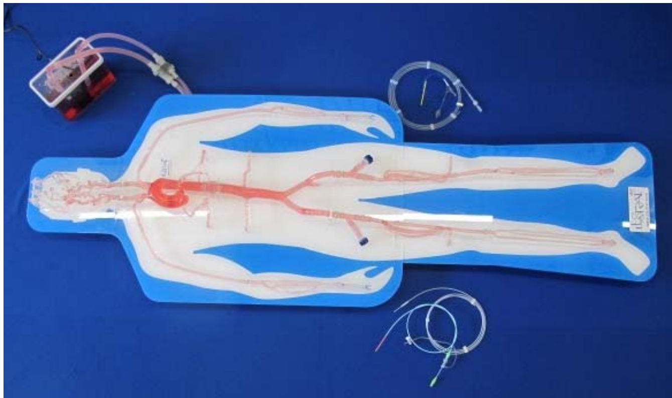
Entry at groin